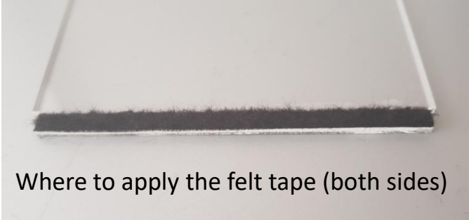
Where to apply the felt tape (both sides)